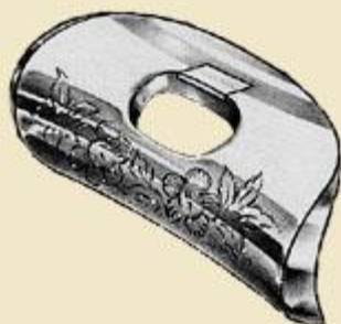
Platinum-Air-Reed™ or Gold-Air-Reed®

Benefit: Lip plate and riser area in front of blow edge shaped to reduce wind noise.